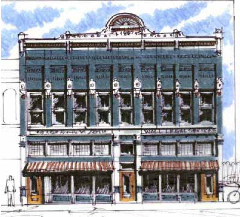
Project after rendering